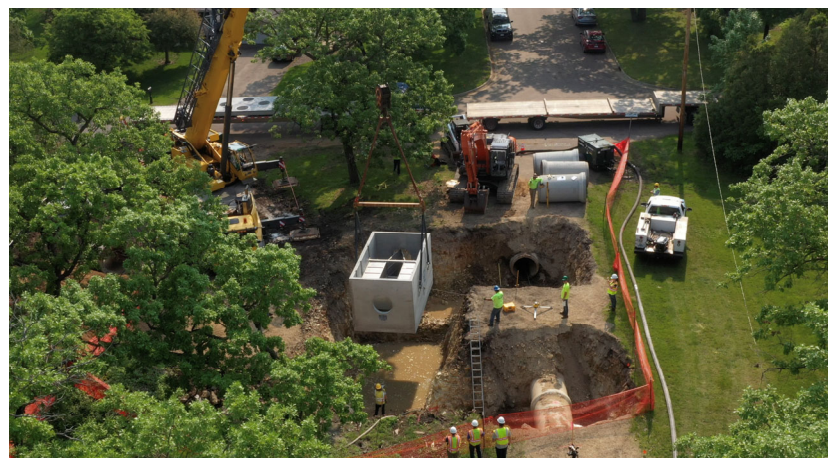
Drone view of DSBB installation by crane