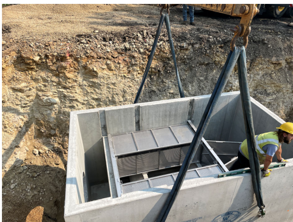
Interior view of the Contech DSBB during installation

Construction was completed in fall of 2023. Other similar systems have already been installed at 15th Street and Cedar Lane in Newport and at Nuevas Fronteras Elementary in St. Paul Park, with more on the way. SWWD is thrilled to be working with our partners on projects like this to improve our stewardship of the Mississippi River!