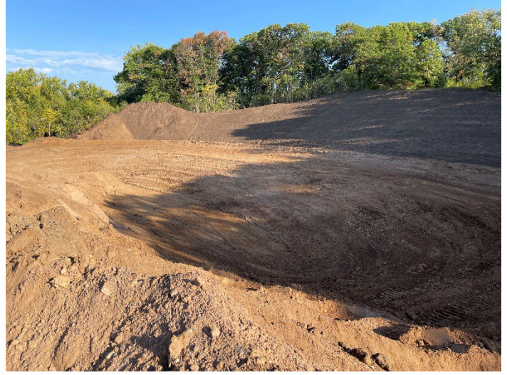
Settling pond rough grading September 2023