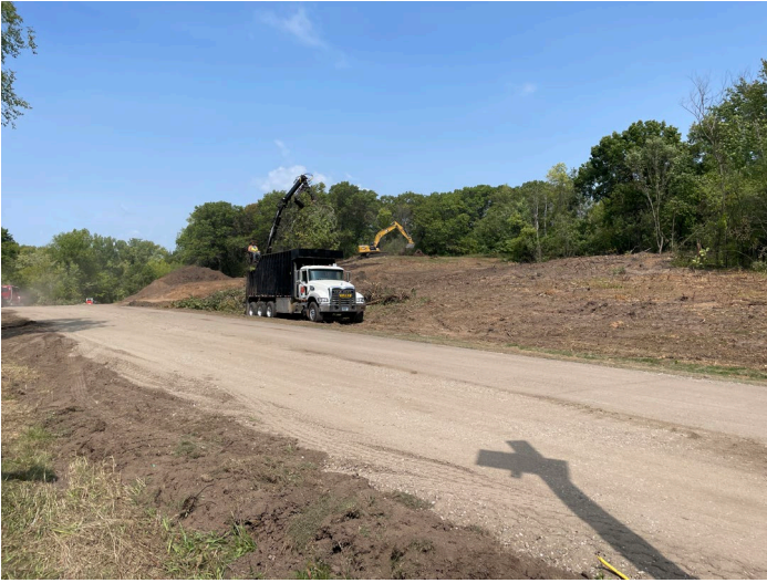
Site clearing and preparation underway August 2023