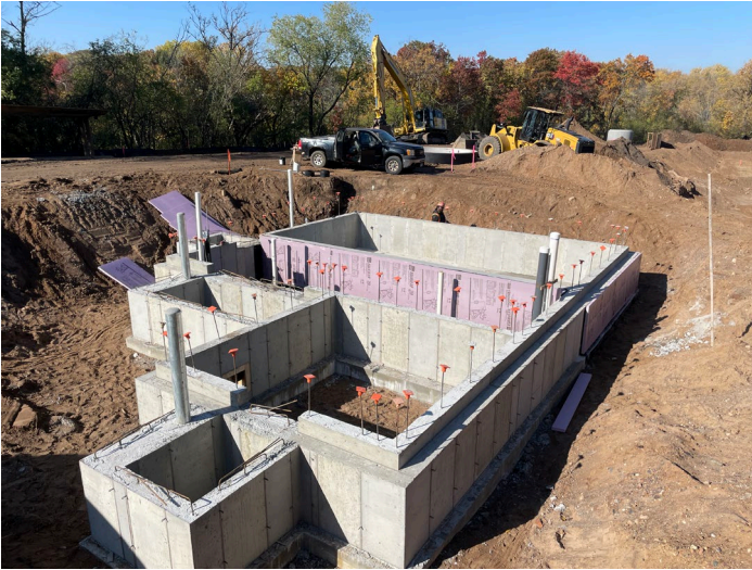
Chemical building foundation installed October 2023