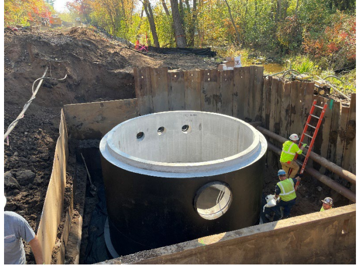
Lift station vault during installation November 2023